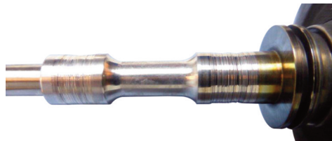
Scoring to journal bearing diameter on shaft & wheel